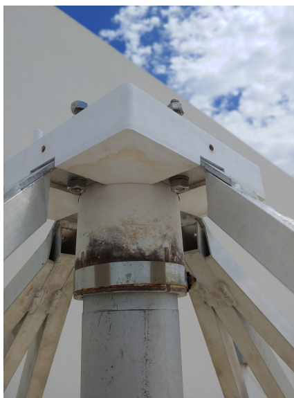
(ii) Bottom View