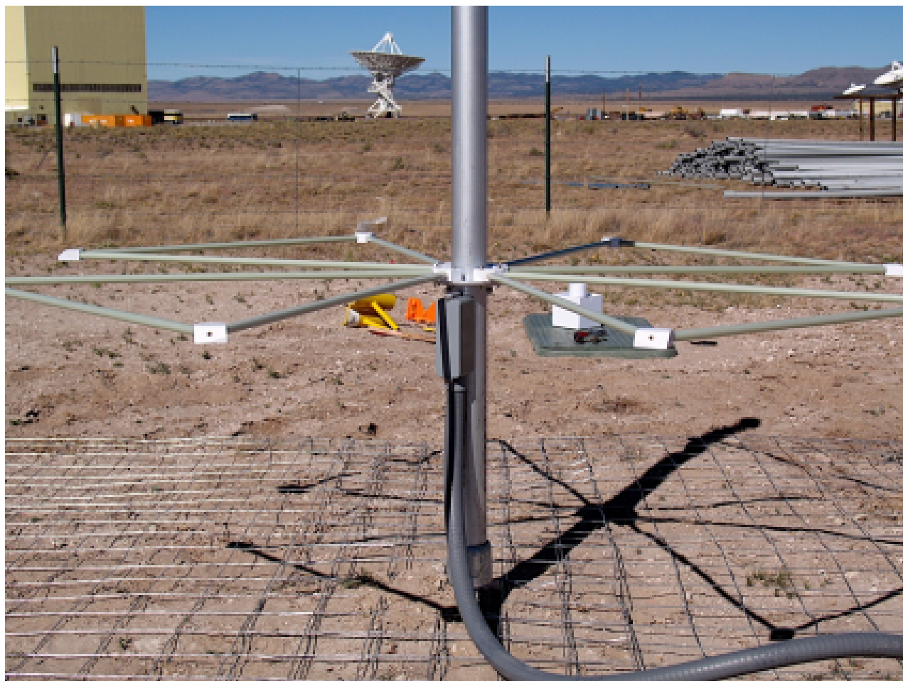
Figure 2: Completed fiberglass support assembly resting on a partially completed antenna from LWA1 construction. This image illustrates the final state after completion of the Fiberglass Supports instruction section. Note the orientation of the of the support triangles as described in the steps above. In this image the flexible conduit is not fully installed in this image, rather at this step expect the conduit to be fixed to the junction box and running under the ground screen into the trenches.