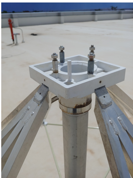
(i) Top View