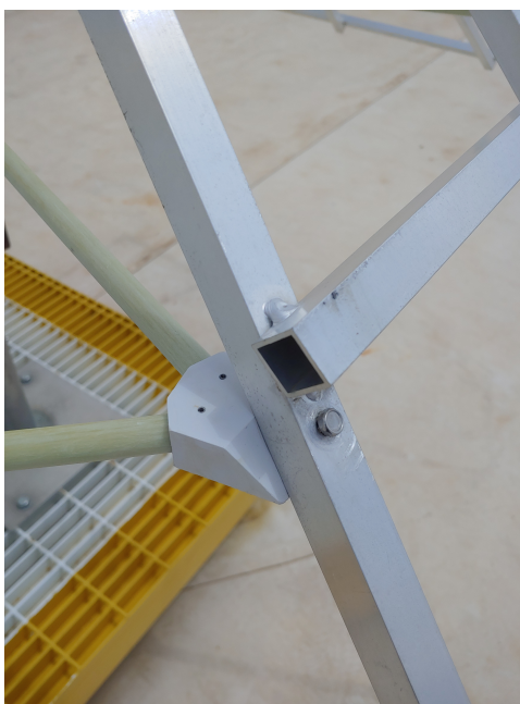
Figure 4: Junction of the antenna arm with the fiberglass support structure. The angle of the support and antenna arm should match, as seen here, and screw in without difficulty.