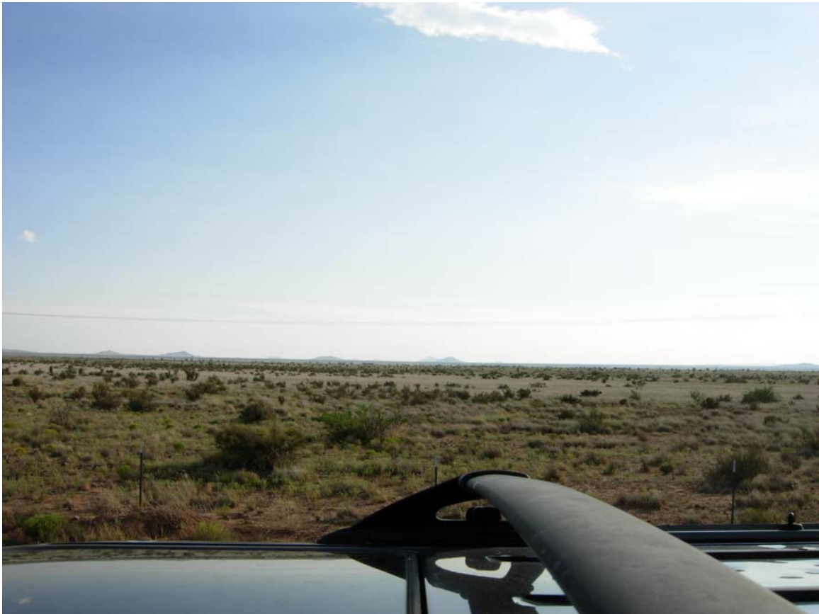
Fig. 7. HT looking southwest from US180.

Conclusion: Good except for possible RFI. Probably ranked below WW only 1-2 miles away.