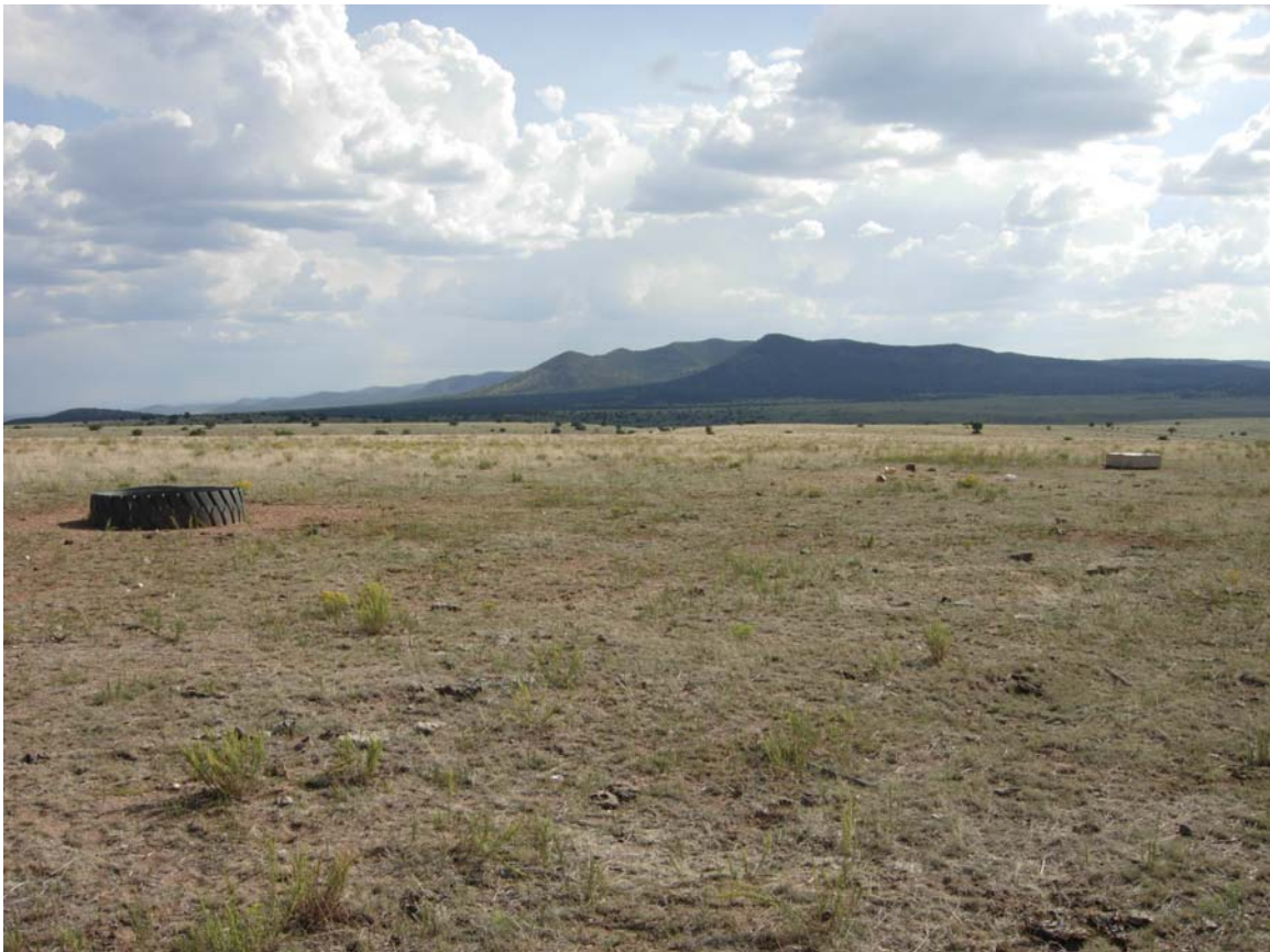
Fig. 14. View southwestward from NM52 at northeast corner of SH. Note the water trough in the left center of the picture.

Additional note: The original site suggested was about a mile further south but the documented one looked better.