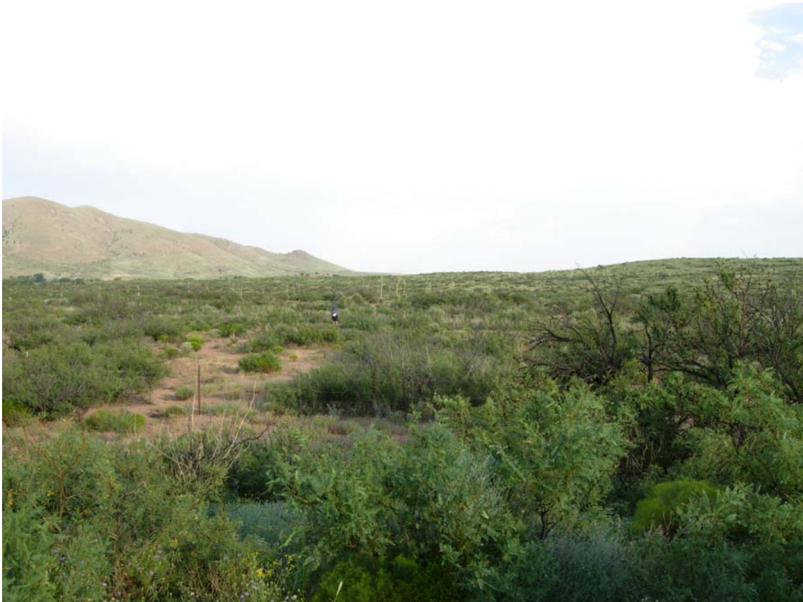
Fig. 8. CR looking eastward from NM61