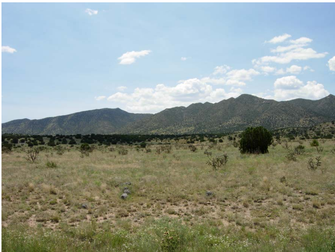
Fig. 13. Looking south at CP from NM52.

Conclusion: Looks ok except for fiber question.