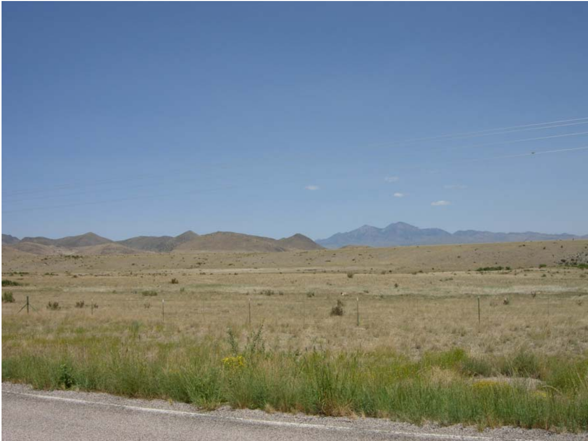
Fig. 12. WS looking north from NM52.

Access: On paved NM52. There might be a larger flatter area on the mesa in the background about ½ mile north and west accessible through a ranch road running north just to the east of the pictured area. There were no posted signs but we did not go to the ranch.