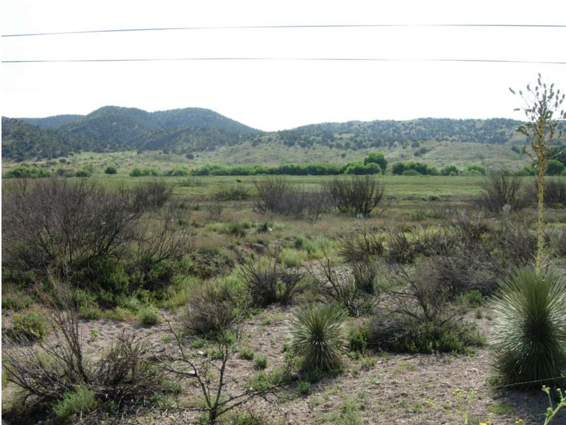
Fig. 5. MS looking westward from US180.

Access: US180 or some tracks in the river basin.