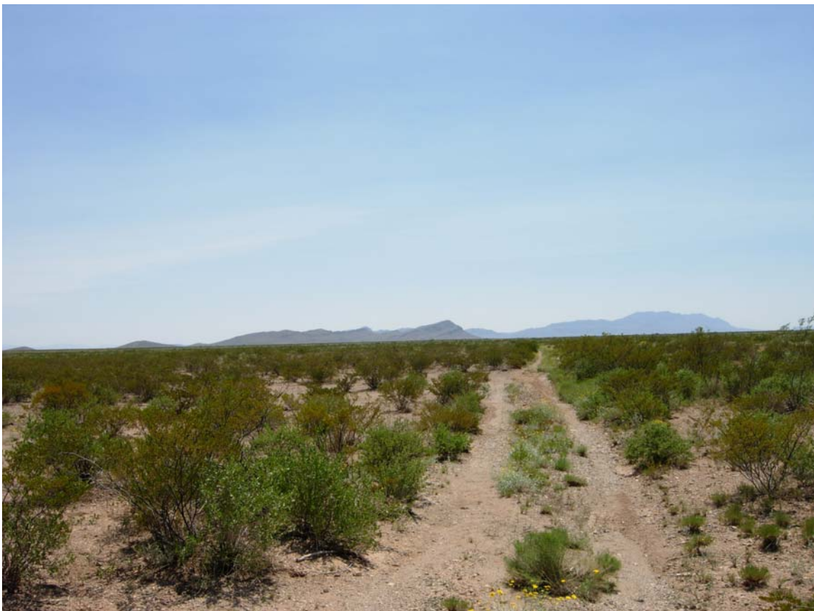
Fig. 11. Looking southeast from CU site.

Access: the dirt road through the wash and up to the mesa top would definitely need 4WD in many seasons and may be impassable in wet weather.