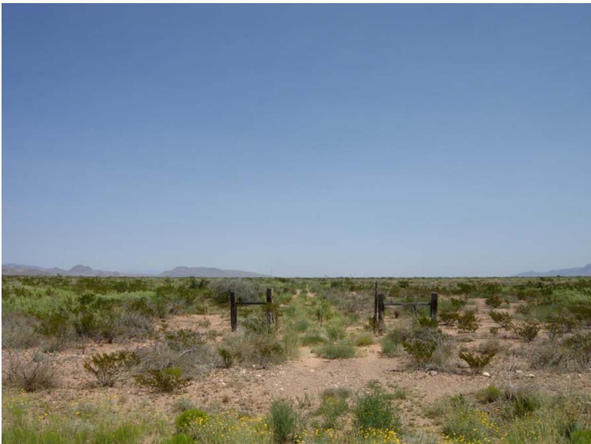
Fig. 10. Gate to AC looking NNE from NM142.

Conclusion: Probably better sites in area.