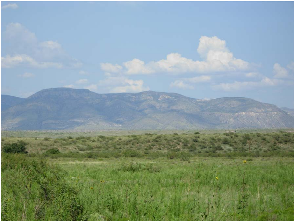
Fig. 4: BU looking eastward from US180

Conclusion: Risky site from water and neighbors.