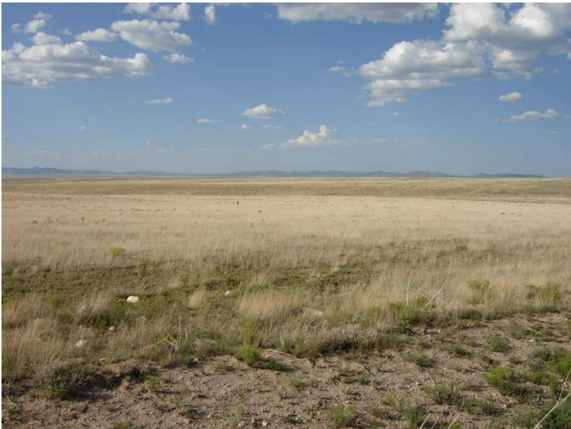
Fig. 16. Looking northwest from VS on NM52.