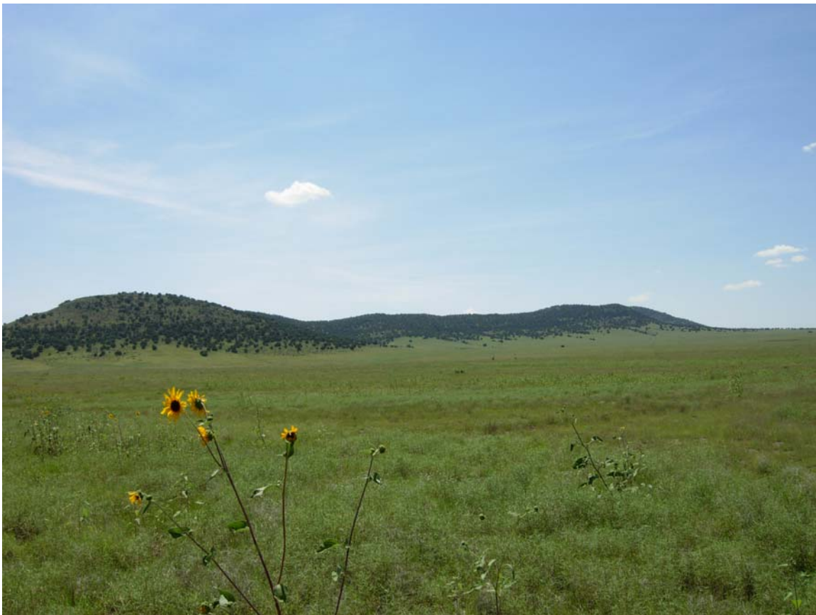
Fig. 3. MC looking westward from just south of NM78.

Access: Excellent along a US and state highway.