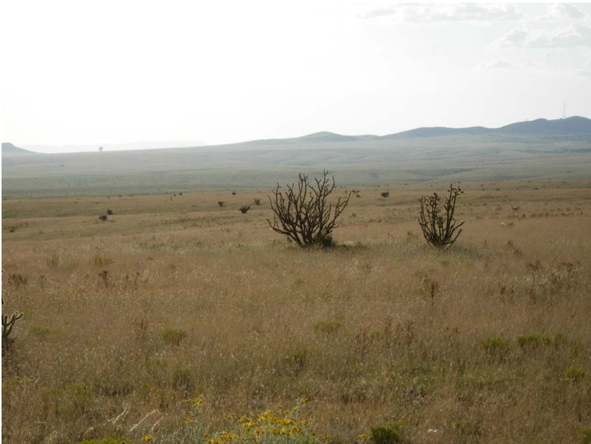
Fig. 17. Looking westward from RC

Conclusion: Good site. Another spot 2 miles to the south is not quite as good and has a further fiber run.