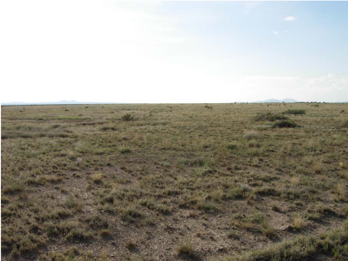
Fig. 6. WW looking northwest from Whitewater Road.

Access: Good dirt road for last 1.5 miles.