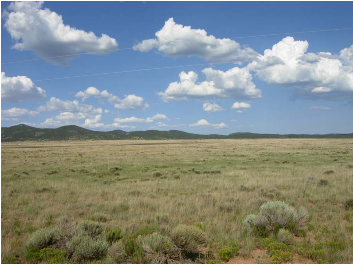
Fig. 15. Looking eastward from NM52 at RS.