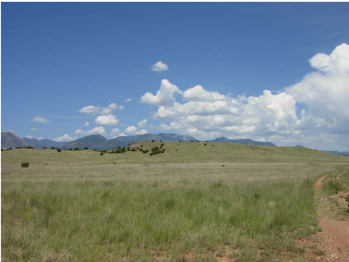
Fig. 2. PL looking eastward from US180.

Perhaps there is a bit flatter land a bit north and west of the road.