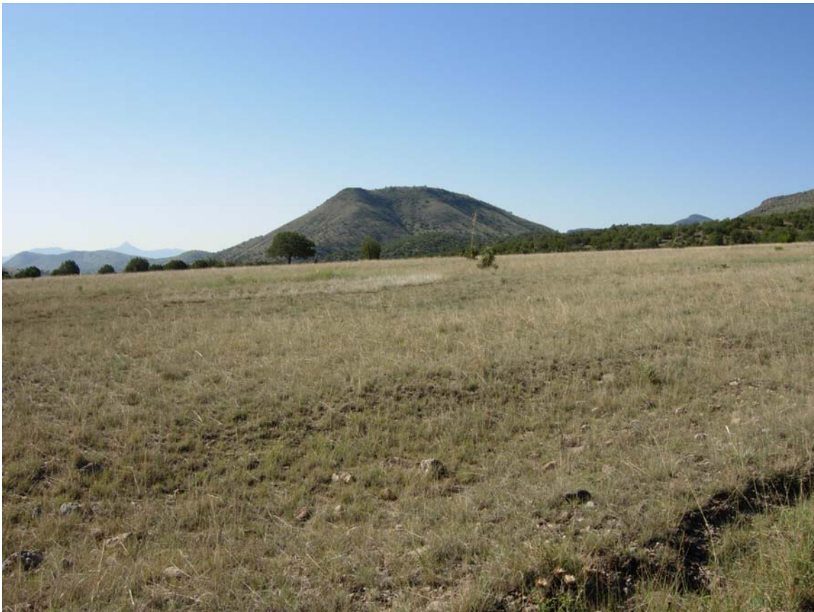
Fig. 9. SJ looking southwestward from dirt access road.

Access: Go through the gate of Harrington Ranch about 100 yards west of intersection of NM152 and NM61 (near mile 15 on NM152). Went through ranch but no signs indicating private access.